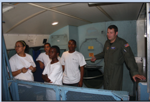
Buckeye Tigers ACE camp tours C-5