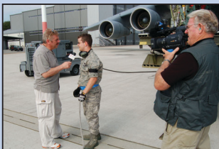
News media cover C-5 mission