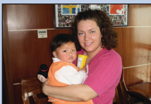
New baby adds joy to reservist's family