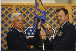
Maintenance flight changes command

Check out the 445th Airlift Wing Web site for the following photos and stories. www.445aw.afrc.af.mil