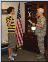
MXG commander's son follows family tradition